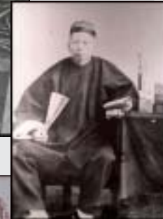
"Lung On of John Day"