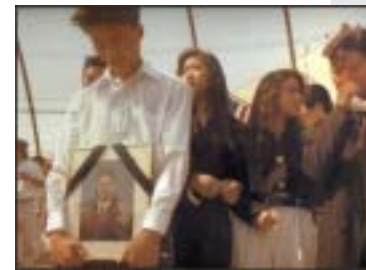
"Commemorating Victims"