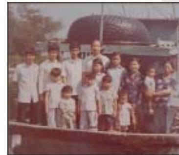
"Family Portrait Before Leaving Saigon"