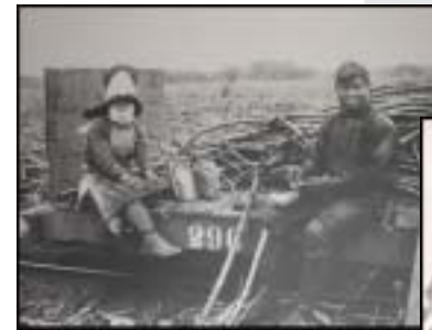
"Japanese Plantation Workers"